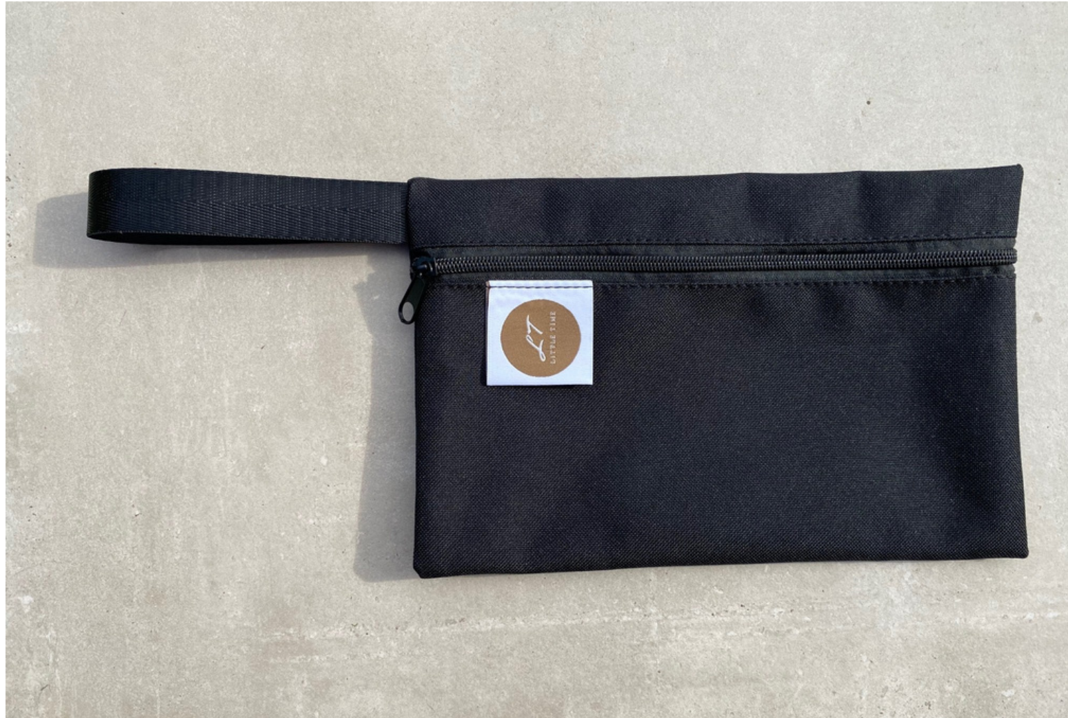
Pouche S 25cm x 16cm